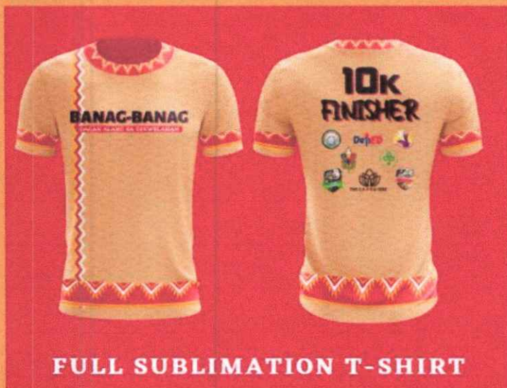
FULL SUBLIMATION T-SHIRT

FINISHER'S SHIRT, FINISHER'S MEDAL, MEAL & RACE BIB