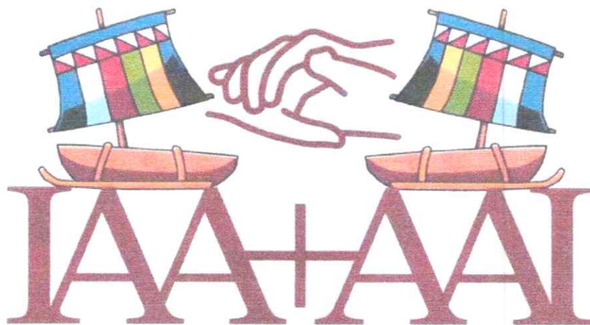
Zamboanga Peninsula Bullying Prevention Caravan for Reinforcing Kindness and Empathy

Select learner: talents from Punta National High School